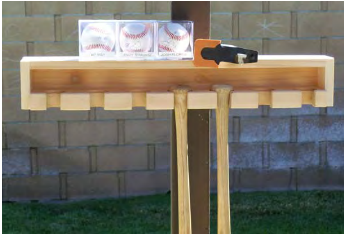
Small wall mount with shelf

We have bat racks for sale to display the bats you have or get at the stadium. The 16 bat rotary rack is $125 with a $25 discount for members while the 12 bat rotary rack is $100 with a $20 discount. Several styles of wall mount racks available – price range is $25 to $50 with a $5 discount to members. We also have several free standing flat bat & ball racks for $80 with a $10 discount to members. If you desire to purchase a bat rack please contact Curt at the membership booth.