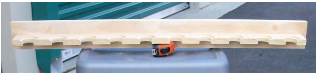
10 Bat Wall Mount