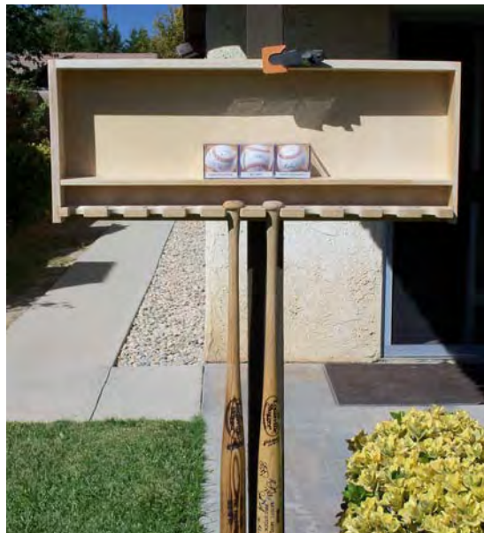
Large wall mount with shelf