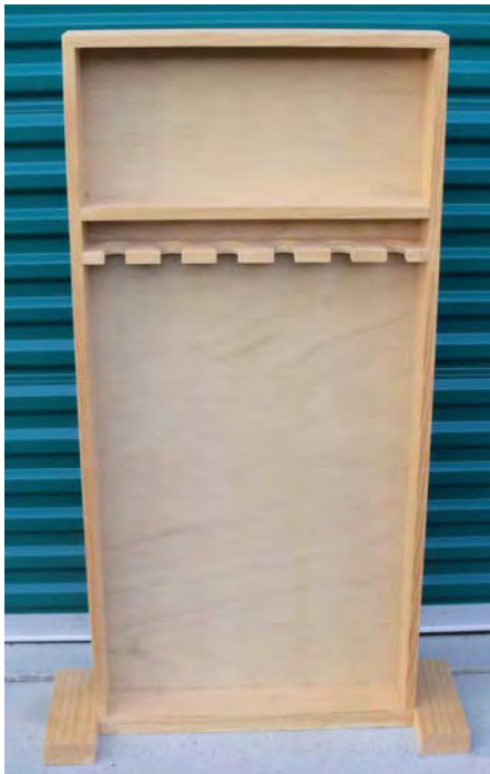
6 Bat Display