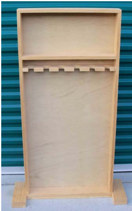
6 Bat Display