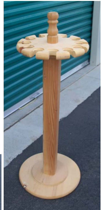
12 Rotary Bat Rack