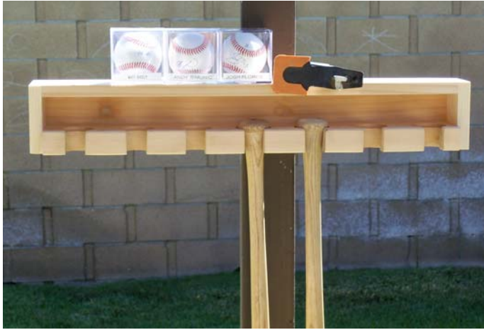
Small wall mount with shelf

We have display bat racks for sale at the stadium. The 16 bat rotary rack is $125 with a $25 discount for members while the 12 bat rotary rack is $100 with a $20 discount. Several styles of wall mount racks available – price range is $25 to $50 with a $5 discount to members. We also have several free standing flat bat & ball racks for $80 with a $10 discount to members. If you desire to purchase a bat rack please contact Curt at the membership booth.