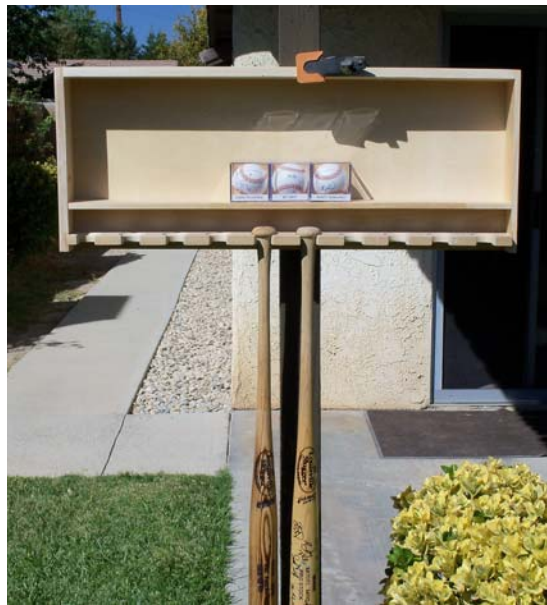
Large wall mount with shelf