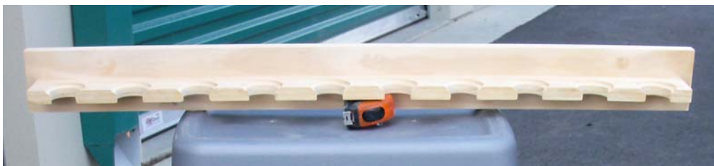
10 Bat Wall Mount