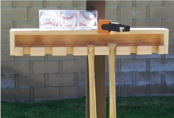
Small wall mount with shelf