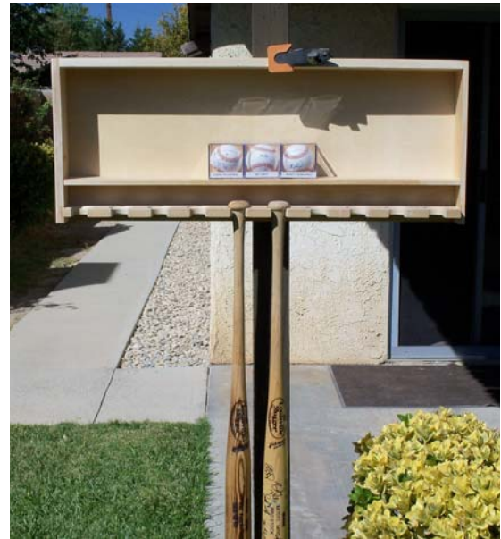
Large wall mount with shelf